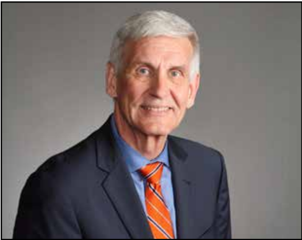
ETHS Superintendent Eric Witherspoon

All students benefit when we examine our structures, practices, policies and procedures to make systemic improvements, reflect on needed changes, focus on students’ differing needs, and have high expectations for everyone. Yes, the rising tide raises all ships, and we have been experiencing a rising tide of improved outcomes for students here at ETHS.